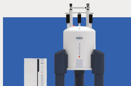
Bruker 600 MHz NMR Spectrometer