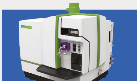
ICP Mass Spectrometry PerkinElmer-NexION 1000