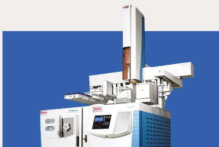
GC/MS Thermo TRACE 1300/ISQ7000