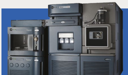
UPLC/MS Waters Acquity+w ZQ2000